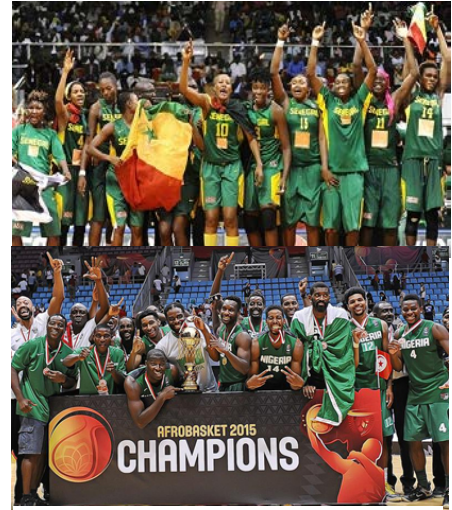
Senegalese Women's and Nigerian Men's Teams, 2015 Afrobasket Champions