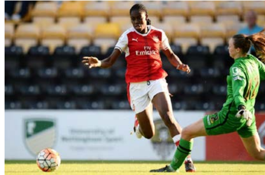
Asisat Oshoala, Nigeria, Liverpool, Dalian Quanjian F.C